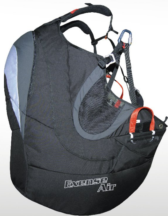
the uncomplicated and smart harness for beginners now also in light-weight construction with airbag