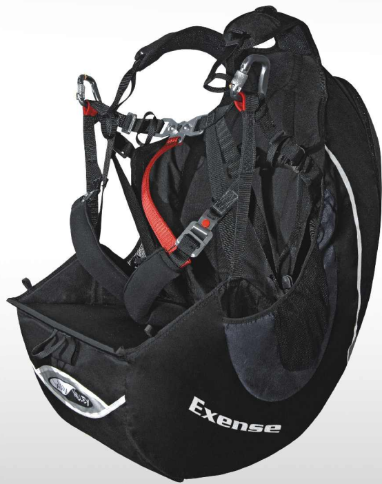
the uncomplicated and smart harness for beginners