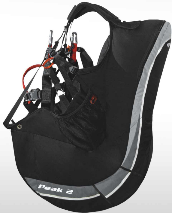
the light general-purpose harness for fun, bivouac and trekking pilots