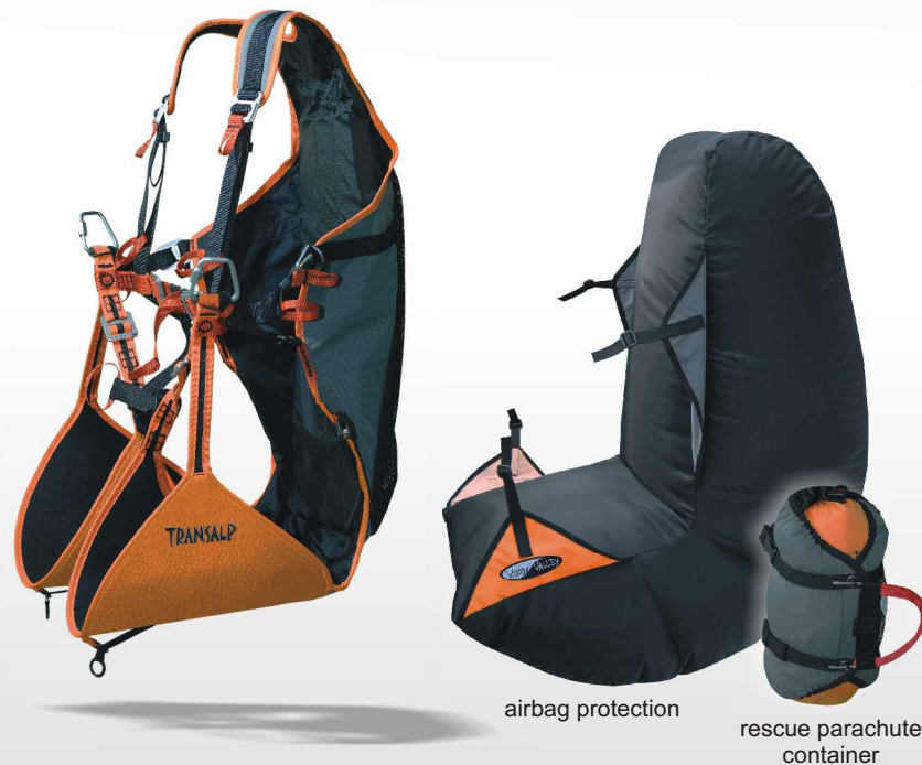
the ultra-lightweight mountain harness