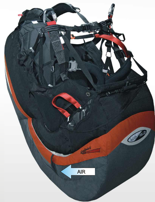
versatile fun and distance harness, more lightweight and with smaller pack size than its brother VELVET 2