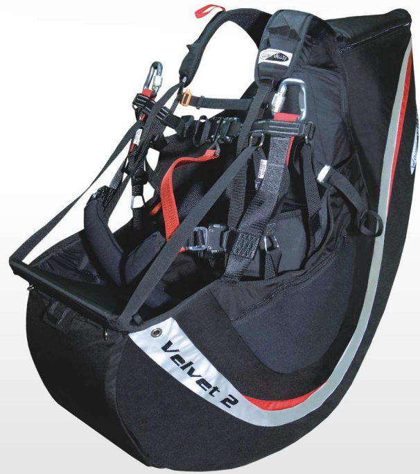
Perfection for the aerodynamic conscious leisure and xc pilot