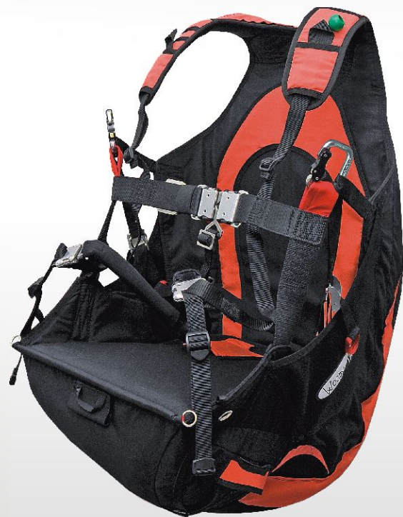
dynamic and safety for freestyle and acrobatic pilots